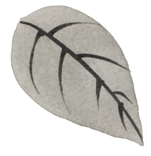
Diagram showing wet on wet and dry on wet ink

Another useful technique for grading washes is to first soak the brush in a lighter tone of ink and then dip the tip in a darker shade, and then draw the brush horizontally across the paper using the brush side. When you come to using colours this is the way one obtains subtle blending of colour, sometimes using several colours on the brush simultaneously