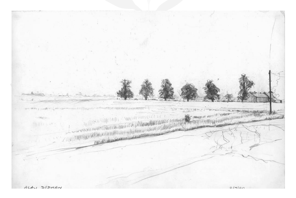
Norfolk landscape by Alan Dedman, 1980.

This sketch gives a clear idea of where the artist is stood in relation to his subject matter. The dark, thin mark on the right is the barely visible outline of a nearby wall. Opposite, a shadow cast over the descending steps leading away from the view, cuts across the vertical of another wall. This helps to frame the view. The steps indicate the fall of the land (the lie of the land) away from the station point. The verticals in the buildings and the direction of the rooftops all add cues as to the feel of the landscape/ townscape.