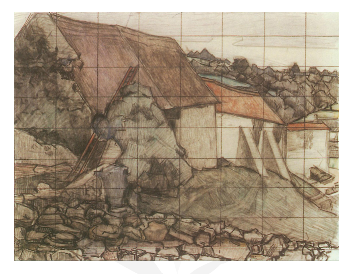
Barns in Somerset by Robert Polhill Bevan, circa 1850 – 1880.

There is a very simple way of enlarging a picture and keeping the same proportions. Look at the picture below. You will see that anything drawn in relation to the hypotenuse (line C) will be larger but in exactly the same proportion as the smaller picture.