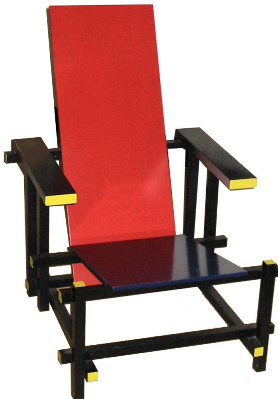
Red and Blue Chair 1918 Gerrit Thomas Rietveld

The classical model of art history appears as a relatively orderly progression until it reaches the 20th century. Although in fact one can observe an increasing degree of self-consciousness and individualism in the work of artists prior to this, it is during the 20 th century when conditions of life changed so dramatically for many – that art began to radically challenge its traditional subjects, forms of representation and general boundaries. This reflected developments in thought that began to challenge established beliefs in other areas: the political economy of Karl Marx (that was ultimately to lead to socialism and communism); the evolutionary theories of Charles Darwin; the philosophy of Nietzsche; the psychology of Sigmund Freud; Albert Einstein's theories of relativity etc. Later in the century two cataclysmic World Wars and the subsequent threat of nuclear annihilation demanded that people should think, hear and see things in a different way. The visual arts responded to this new and changing world by reflecting and challenging it – through what has become termed as Modernism. It is important to understand the way in which this term can be applied to a very diverse and at times, apparently conflicting series of movements and directions in art from near the end of the 19 th century to the middle of the 20 th century.