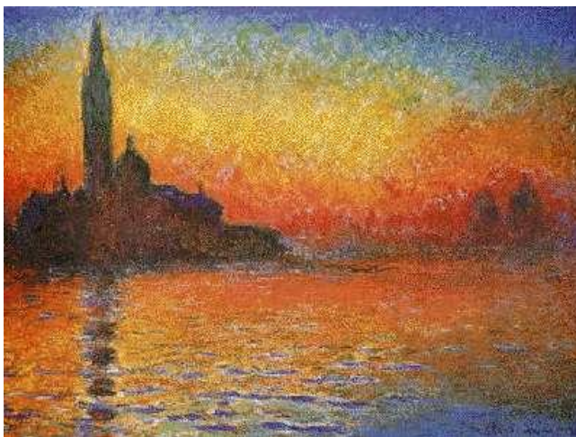
San Giorgio Maggiore at Dusk 1908 Claude Monet

The Impressionists pioneered the use of light in painting as they attempted to capture light as seen from the human eye. Edgar Degas, Édouard Manet, Claude Monet, Camille Pissarro, and Pierre-Auguste Renoir , were all involved in the Impressionist movement. They were not only interested in the landscape but also believed in painting directly from life and therefore much of their work was carried out 'en plein air' or outside of the studio, though sometimes completed in the studio.